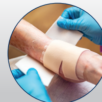
ADVANCED WOUND CARE